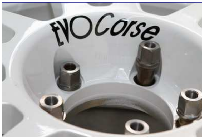
Wheels are supplied directly with the new QPS System installed